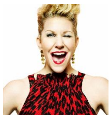
Joyce Di Donato, Mezzo-Soprano

“Performing with the Chamber Orchestra of Europe has been a dream, I have never heard wind-playing, string-playing and horn-playing quite so beautiful.”