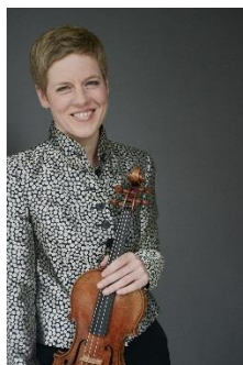
Isabelle Faust, Violinist

“It is such an incredible experience to be with this orchestra! I have waited a long time for this moment and of course it's wonderful to be their chosen soloist for their first performance of Berg's Violin Concerto with Maestro Haitink. It can't ever get better than that so thanks for this absolute highlight.”