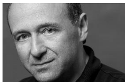
Ivan Fischer, Conductor

“It is such an incredible experience to be with this orchestra! I have waited a long time for this moment and of course it's wonderful to be their chosen soloist for their first performance of Berg's Violin Concerto with Maestro Haitink. It can't ever get better than that so thanks for this absolute highlight.”